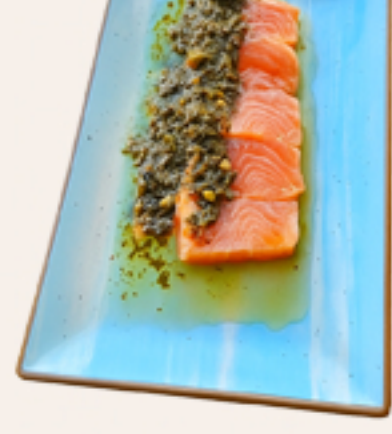
SALMON SASHIMI WITH HOMEMADE CHIMICHURRI