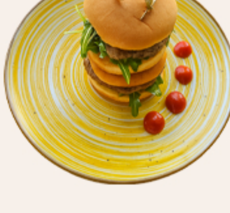
MINI GOURMET HAMBURGER WITH TRUFFLE MAYONNAISE