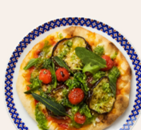
GENOVESE PINZA PESTO, FRIED EGGPLANT SUN-DRIED TOMATOES, CAPERS, AND ARUGULA