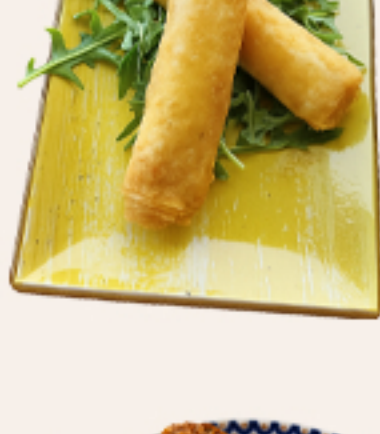
CRISPY FETA CHEESE WITH MINT