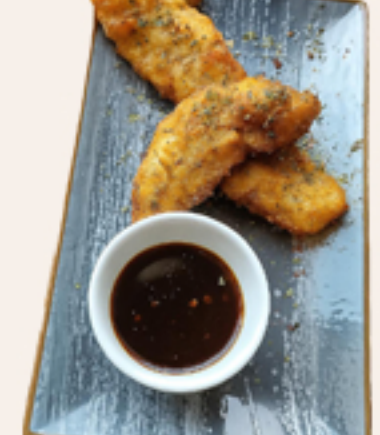
CRISPY CHICKEN WITH SWEET AND SOUR SAUCE