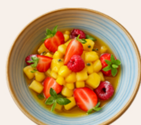
TROPICAL FRUIT SALAD, WITH BERRIES