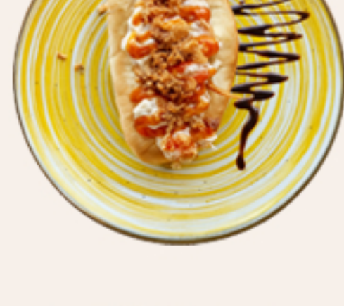
SHRIMP ROLLS WITH WASABI