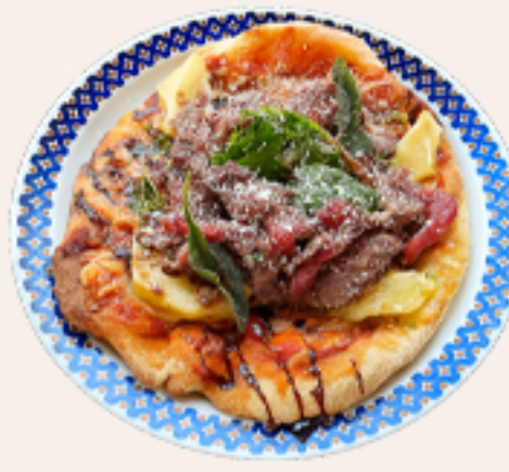
NEW YORK PINZA HOMEMADE PASTRAMI, ARTICHOKES, PARMESAN, AND CHIMICHURRI