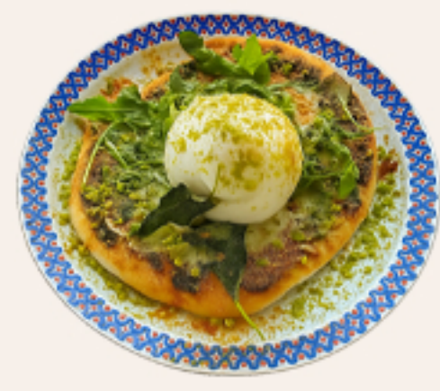
TRUFFLE PINZA TRUFFLE, BURRATA, AND PISTACHIO