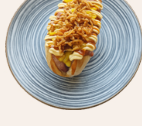
CHILEAN COMPLETO WITH CHORIZO (HOT DOG)