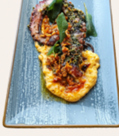
GRILLED OCTOPUS WITH SPICES AND CHORIZO MAYONNAISE