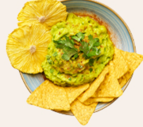
GUACAMOLE WITH GRILLED PINEAPPLE