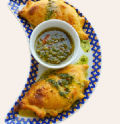
CHILEAN EMPANADAS WITH HOMEMADE PEBRE