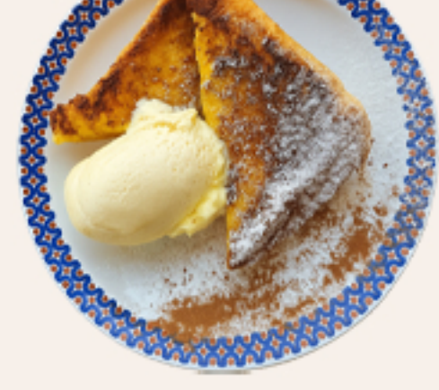
CARAMELIZED TOAST, WITH VANILLA ICE CREAM