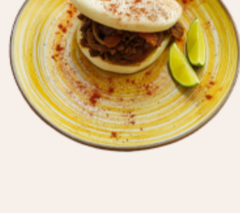
PULLED PORK BAO COOKED FOR 7 HOURS