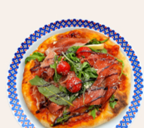
PROSCIUTTO PINZA CURED HAM, FRESH MOZZARELLA, AND CHERRY TOMATOES