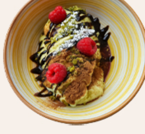
PISTACHIO TIRAMISU WITH , AMARETTO AND RASPBERRIES