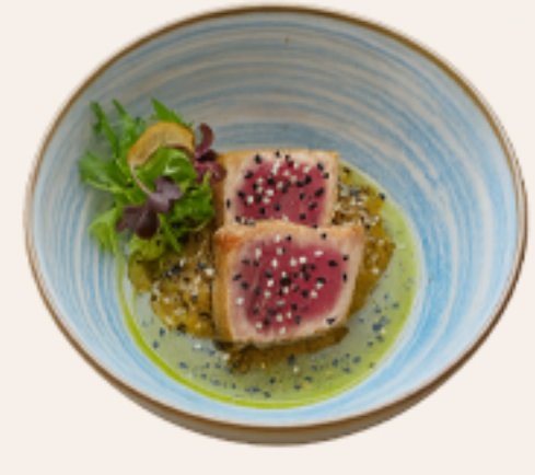
GRILLED TUNA WITH TWO TYPES OF SESAME